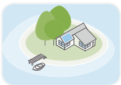
Residential off-grid solar